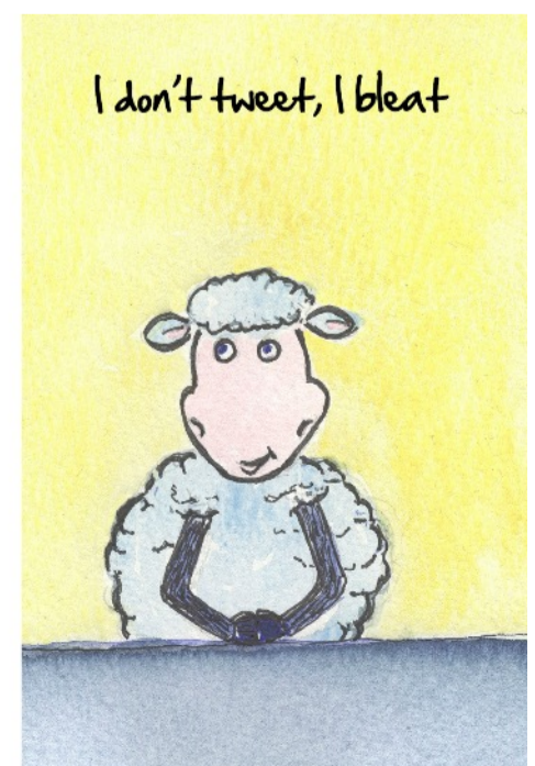
I don't tweet, I bleat

© 2013 Claire Savill Card designed and produced by Claire Savill www.ruralworking.co.uk