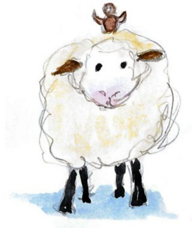
I don't tweet... I bleat!

© 2014 Claire Savill Card designed and produced by Claire Savill www.ruralworking.co.uk