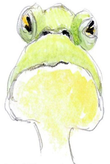
I don't like morning people, or mornings or people.

© 2014 Claire Savill Card designed and produced by Claire Savill www.ruralworking.co.uk