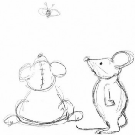
You will have a long wait for the honey!

The inside of this card has been left blank for your own message