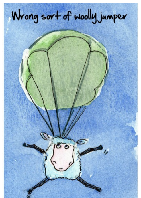
Wrong sort of woolly jumper

© 2013 Claire Savill Card designed and produced by Claire Savill www.ruralworking.co.uk