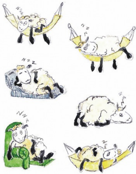
Lazy Sheep on Exmoor

The inside of this card has been left blank for your own message