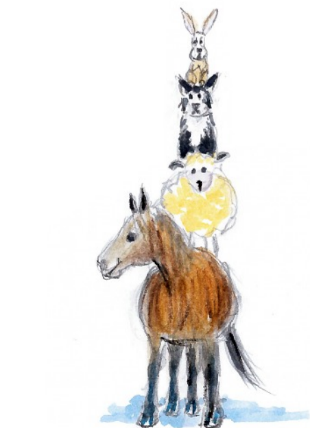
Social networking Exmoor style!

The inside of this card has been left blank for your own message